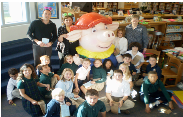
Students at Loudoun Country Day School Celebrate with Hamlet